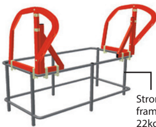
Strong and robust frame weighing only 22kg

660mm high for optimal operator protection